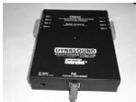
DS8000 Network 8 ohm