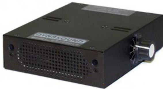
DS1390 Soundmasking / Paging Speaker