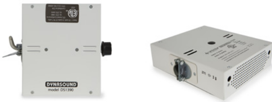
DS1390 and DS1398

Ceiling plenums and Raised access floors: Reverberant cavities above and below office walls can easily transmit sound from one space to another.