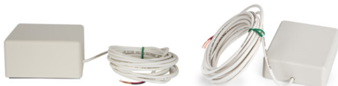
DS2500 and DS2508

The DS2400 (70v) and DS2408 (networked) pipe, duct, and wall sound maskers are used to protect pipes, ducts, and walls against human and electronic eavesdropping by filling them with full bandwidth sound masking.