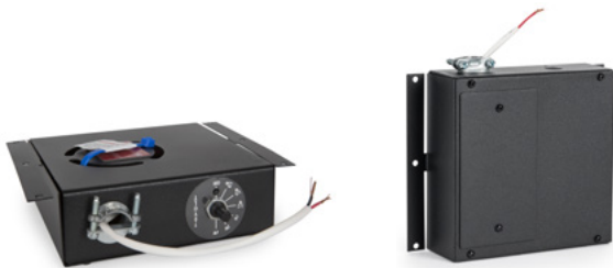
DS2400 and DS2408

The DS1390 (70v) and DS1398 (networked) use dual, horizontally opposed speakers to produce uniform sound dispersion ideally suited for reverberant under floor cavities and shallow ceiling plenums.